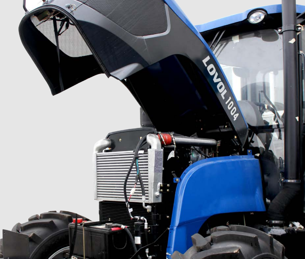
Standard Lovol engine: Cylinder number: 4; Displacement: 4L; Engine power: 66-80 kW (80-100Hp); PTO power: 56-68kW; Rated speed: 2,200; Intake mode: natural intake.

The tractor is equipped with the well-known Donaldson two-stage dry air filter, which is high in filtering efficiency and easy to maintain. In such case, the reliability and fuel efficiency of the tractor are improved, and the maintenance time and cost are saved.